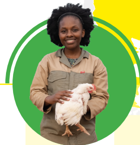
FARMERS, PEASANTS, FISHERFOLKS, FOREST DWELLERS